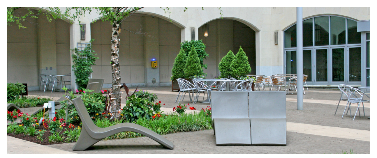
201 Wood St Pittsburgh, PA 15222

Eisler Landscapes installed the original plantings in 2011. Plantings included two Frontier Elms, six Dura Heat River Birch, 15 Climbing Hydrangeas, Liriope and Daffodils.